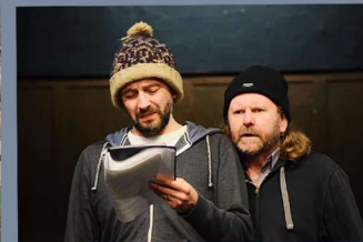
Rehearsal/behind the scenes photography by Lilly Beards